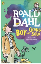
Boy and Going Solo by Roald Dahl