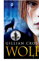
Wolf by Gillian Cross