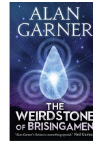
The Weirdstone of Brisingamen by Alan Garner

Here are a range of fun activities you can do to accompany your reading. Choose as many as you like to complete (but try at least one per week)