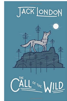
The Call of the Wild by Jack London