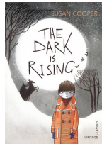
The Dark is Rising by Susan Cooper

https://openlibrary.org/ Register with your school email address; subscribe and choose ANY book to read!