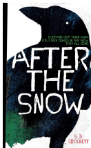
After the Snow by S D Crocket