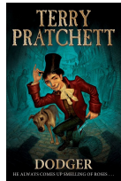
Dodger by Terry Pratchett

https://openlibrary.org/ Register with your school email address; subscribe and choose ANY book to read!