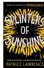
Splinters of Sunshine by Patrice Lawrence

Here are a range of fun activities you can do to accompany your reading. Choose as many as you like to complete (but try at least one per week)