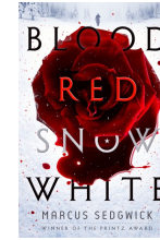
Blood Red Snow White by Marcus Sedgwick