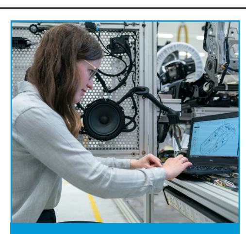
BEM (BUILDING ENERGY MANAGEMENT SYSTEMS) CONTROLS ENGINEER

This apprenticeship is within the building services sector and your child will be learning how to create the most efficient energy management systems, which include heating, ventilation and air conditioning for the public, commercial and industrial buildings. This can also include writing-related software for the design and following up with service and maintenance to the system.